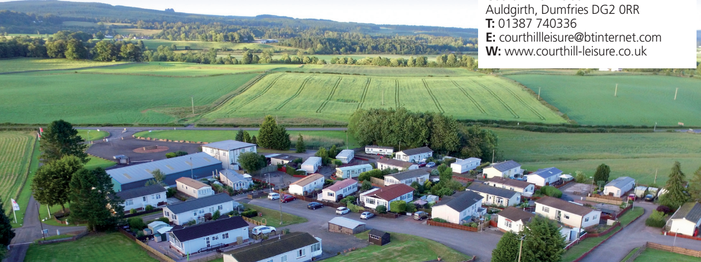
ABOVE: This bird's eye view of Courthill Park perfectly illustrates its scenic, countryside location